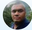
Shri. VISHAL MALI DFO (Wildlife), Kolhapur

: Topic : Illegal Wildlife Trade (Indian Context )