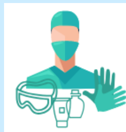
Personal protective equipment (PPE)